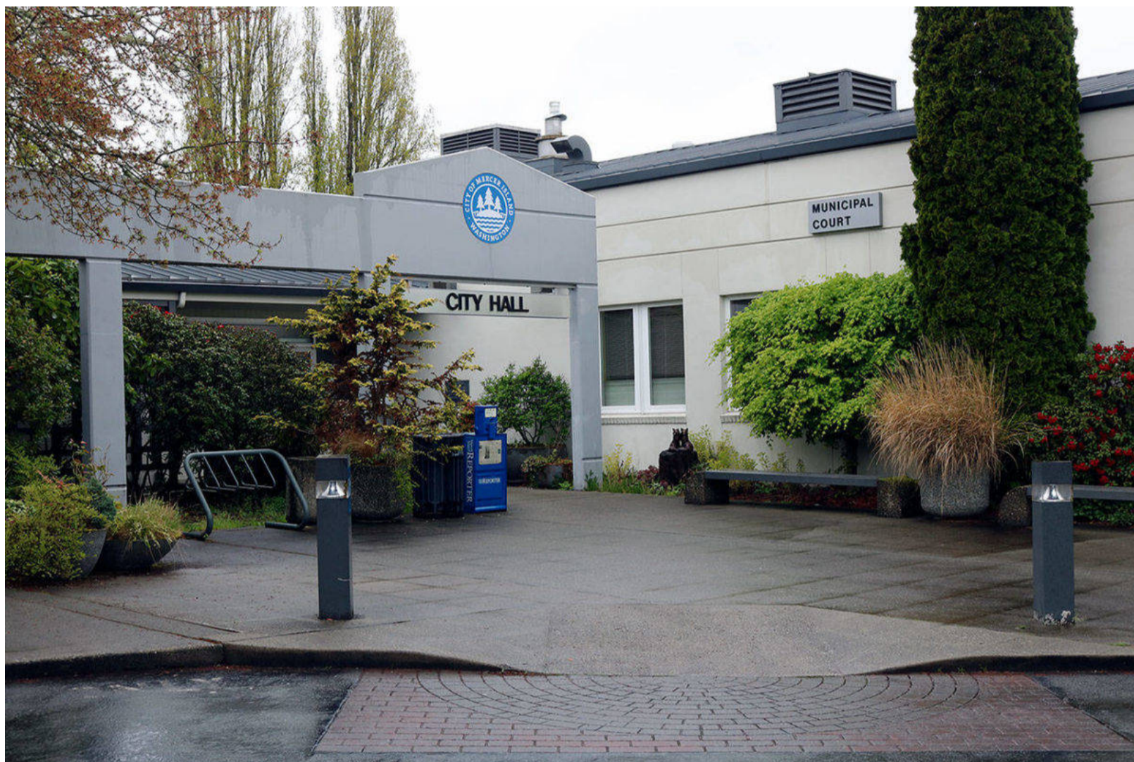
Mercer Island City Hall.