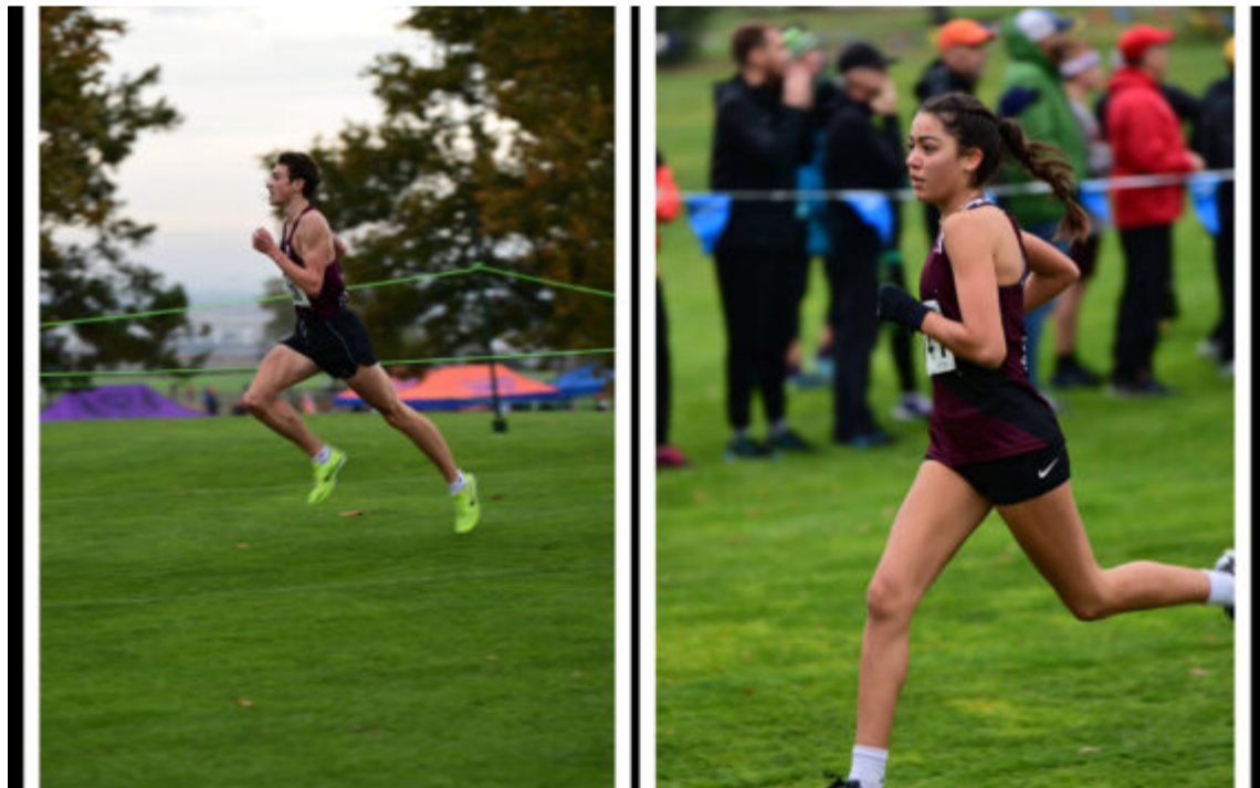
Top 10 Plays of the Day, 11/05/2023

By Cameron Sheppard • November 6, 2023 1:15 pm